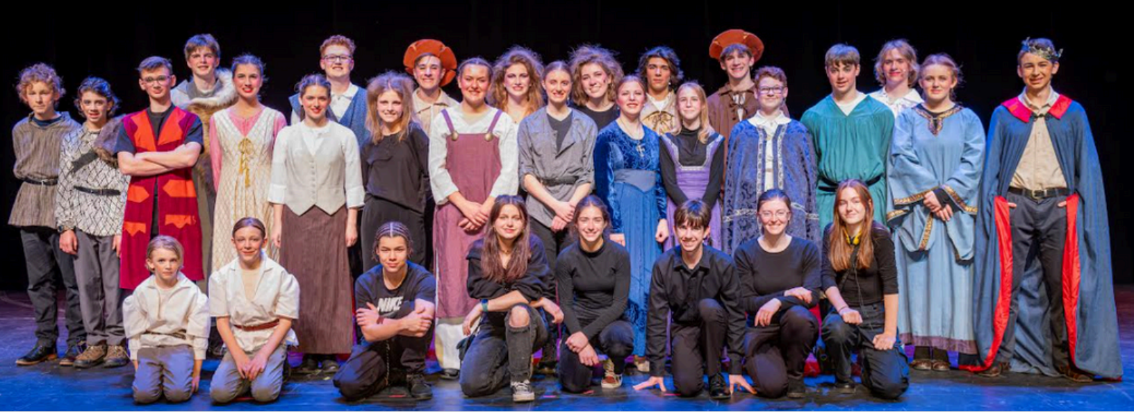
CAST AND TECH CREW OF OUR SPRING PLAY - MACBETH